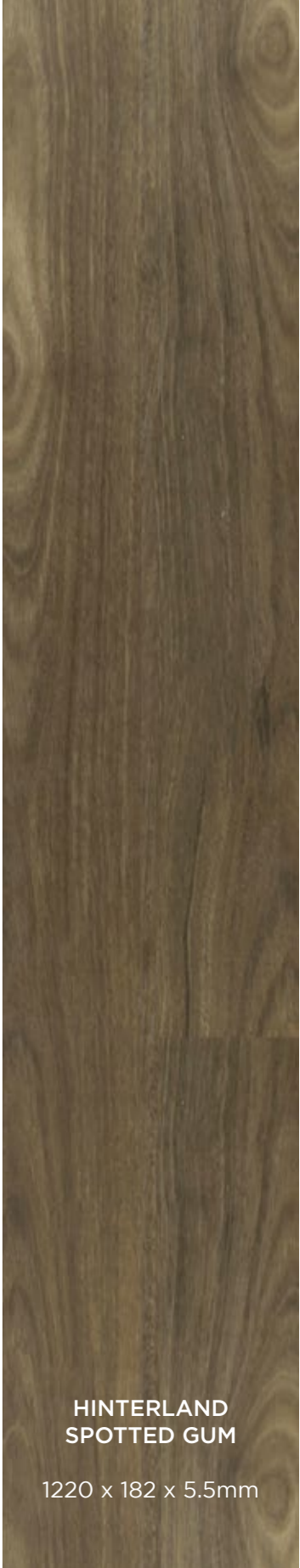
HINTERLAND SPOTTED GUM