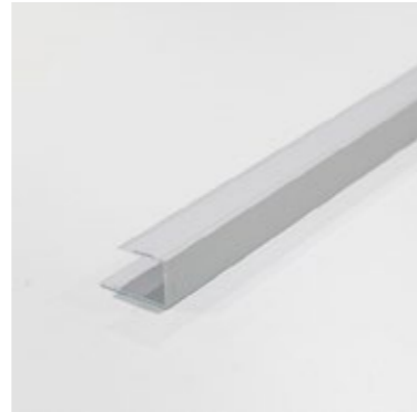
MID END 3400 x 19 x 12mm