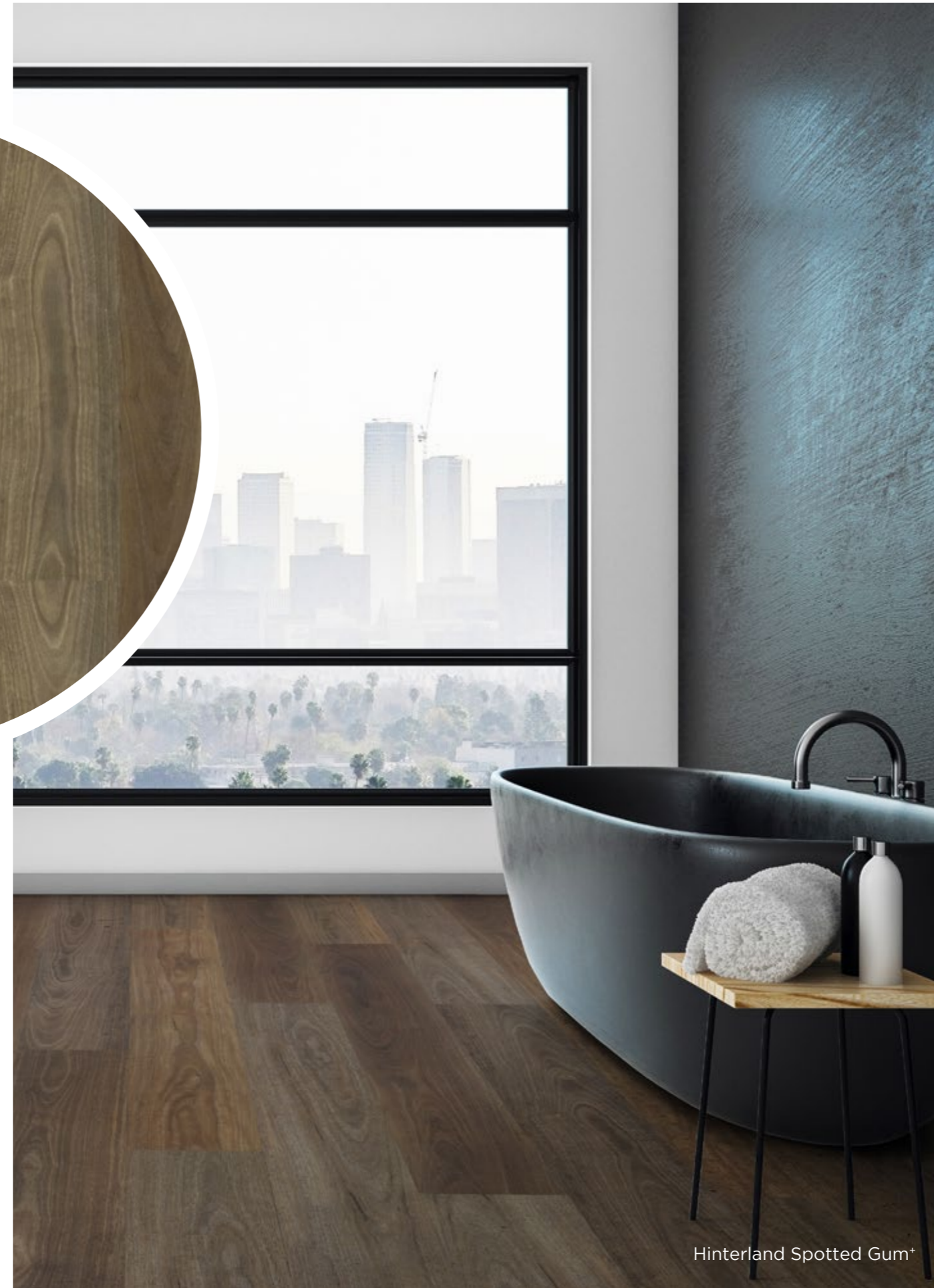
Hinterland Spotted Gum*

Supplied with a pre-installed noise reduction underlay, Atlantis planks are easy to handle during installation. The tried and tested drop lock profile is quick and easy to install with no messy glues required, allowing you to walk on your floor the same day it is laid.