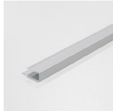
JUNIOR END 3400 x 19 x 8mm