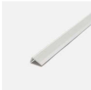
MULTI ANGLE 3400 x 19 x 7mm