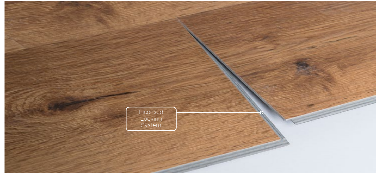
Licensed Locking System