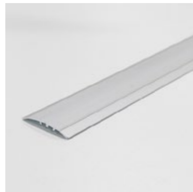
COVER TOP 3400 x 45mm