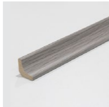
SCOTIA 2400 x 19 x 19mm

All flooring accessories available in vinyl wrap colour range depicted.