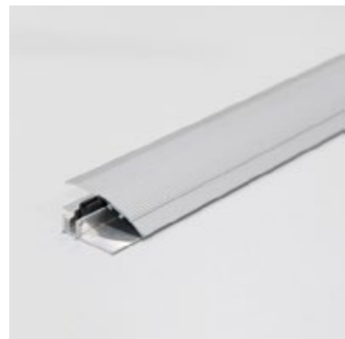
UNIVERSAL 3400 x 45mm